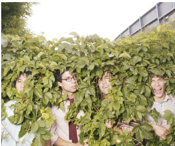
The Acorn is (left to right):